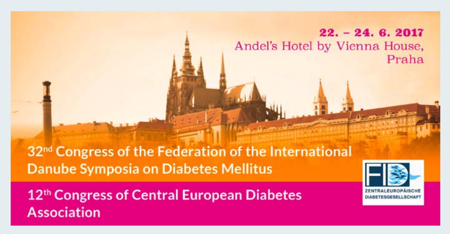
Abb. 1: Lessim zzril duismodit adipsuscipit adio conum irit velessectem qui tatio odit magna

Complications in diabetes entitled "Pavement to vascular disease" were opened by Peter Nawroth (Germany) who discussed the role of fibrosis in