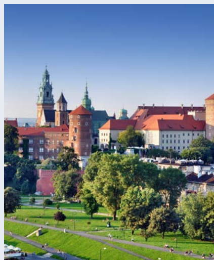
The 13 th Congress of the Central European Diabetes Association (CEDA)/33 rd International Danube Symposium was held in Krakow, Poland – with twenty-three outstanding plenary lectures.

The scientific sessions were accompanied by “Meet the Expert” and industry sessions.