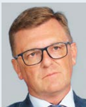
T. Klupa 1,2

On June 14-16 the 13 th Congress of the Central European Diabetes Association (CEDA)/33 rd International Danube Symposium was held in Krakow, Poland ( www.donau2018.jordan.pl ).